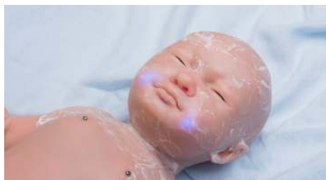
Cyanosis, jaundice, pink, and pallor