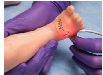
Pre and postductal SpO 2