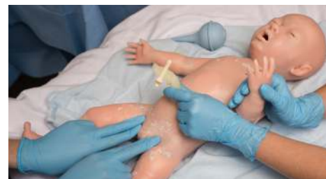
Pulses: fontanel, brachial, umbilical, femoral