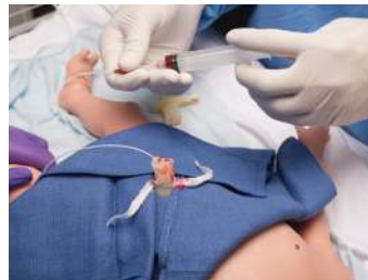
Continuous UAC/UVC infusion