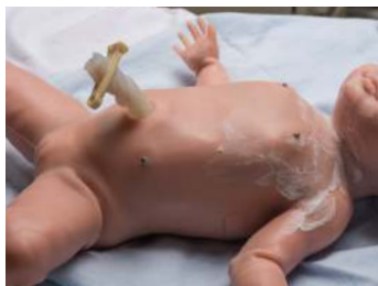
Retractions, "see-saw" breathing