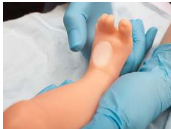
Capillary refill time testing