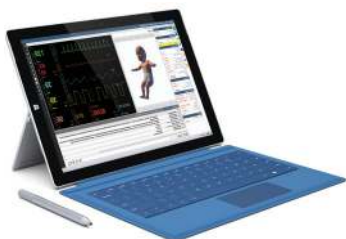
UNI® Interface powered by Microsoft® Surface