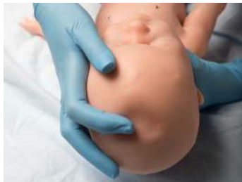
Sunken, bulging, and normal