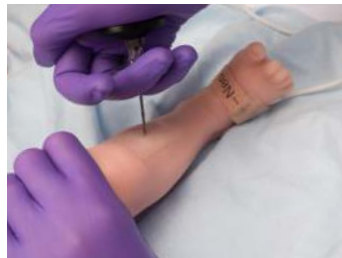
Hand, scalp, umbilicus, IO access