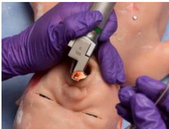
Anatomically accurate airway